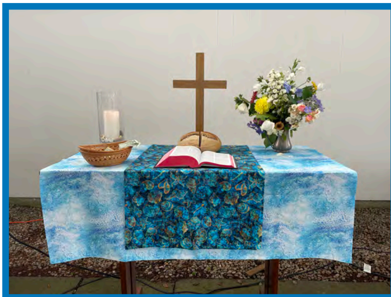
Communion Table “Jesus is the Bread of Life” FIUC Worship Under the Tent in August