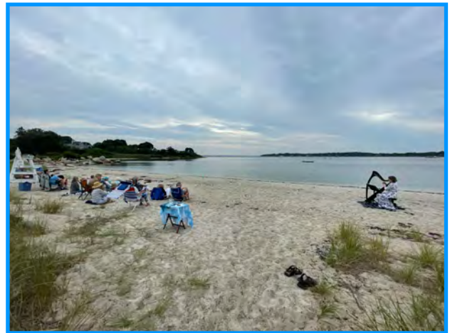
Beach Church August 8th